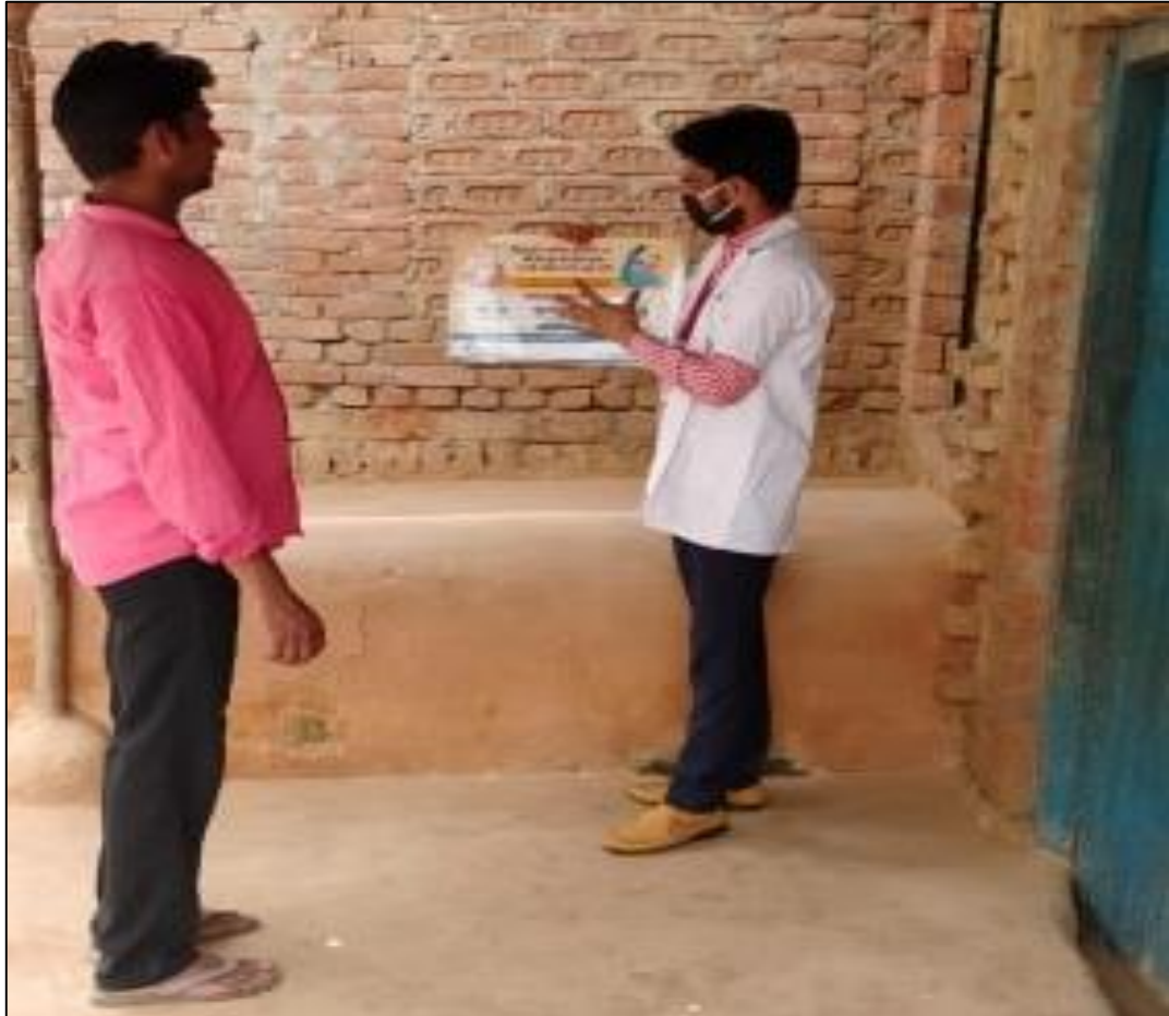
Door to Door Campaign