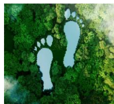
Greywater Management Planning and Design