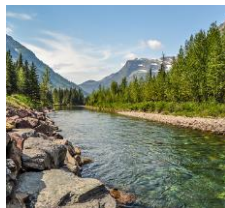
Enabling Environment For Effective Implementation