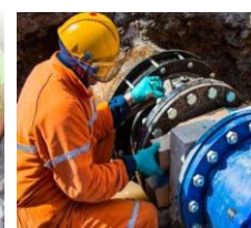
Operations and Management Of Community Water Supply