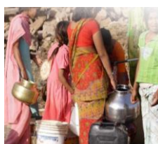
Implementation of iTapWater IEC Activities