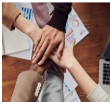
Stakeholders of iTapWater Roles and Responsibilities