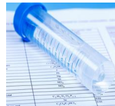
Water Quality Testing Monitoring and Surveillance