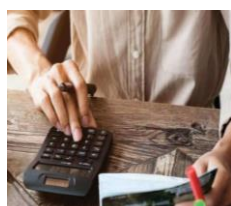
Financial Planning Water Budget For iTapWater Scheme