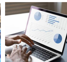
Monitoring and Evaluation Of Progress and Water Quality