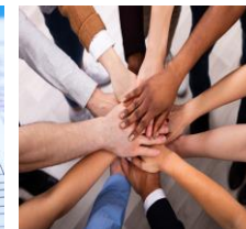
Participatory Rural Appraisal For Community Mobilisation