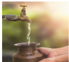
Planning For Your Water Supply Case Study From India

WEB BASED TOOLS: 12 MODULES, 45 SUB-MODULES AND 107 TOOLS FOR RELIABLE DELIVERY OF SAFE WATER THROUGH FUNCTIONAL HOUSEHOLD TAP CONNECTIONS