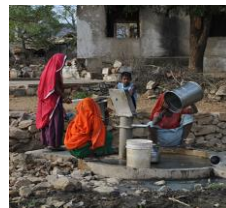
Village Action Plan Preparation and Strategy